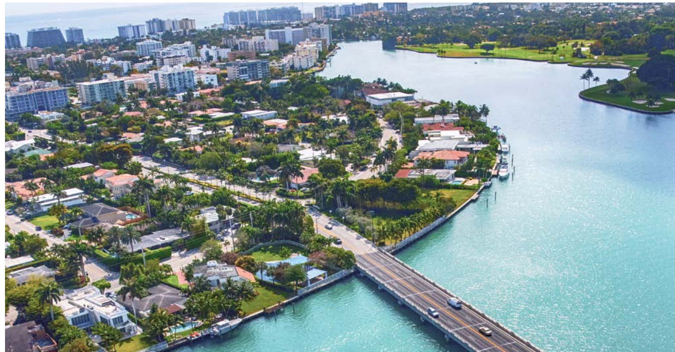
BAY HARBOR ISLANDS

From Aventura and Sunny Isles to the downtown skyline and panoramas of Biscayne Bay, residents enjoy unparalleled access to Miami's most sought-after areas. Relax at home in a quiet enclave at Solana Bay or embrace South Florida's nearby signature shopping, five-star dining, and world-class entertainment. The options are endless.